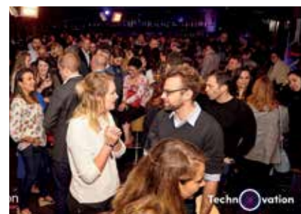
Networking at the TechnOvation night

The first edition of TechnOvation at IMEX in Frankfurt, Germany was an incredible success with more than 300 guests. Participants gathered for a unique night to network and share trends about upcoming tech challenges that the meetings industry will be facing.